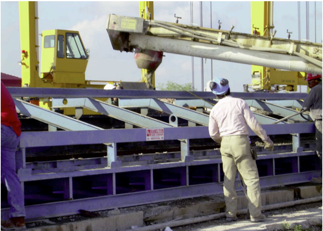
Form for Cowboys Stadium at Heldenfels Enterprises

Higher volume products may require a dedicated form, while it may be advantageous to design some forms that can be adjusted with the use of fillers and risers to produce two or three different cross sections. Prestressed stadium forms, as with all self-stressing forms, require jacking end plates to transfer the prestress load into the form. When fillers and risers are used to produce multiple products in a single form, strand patterns move further away from the base of the form. This changes the load paths and greatly complicates the structural design of the form. That's why most stadia forms produce no more than two or three different cross sections.