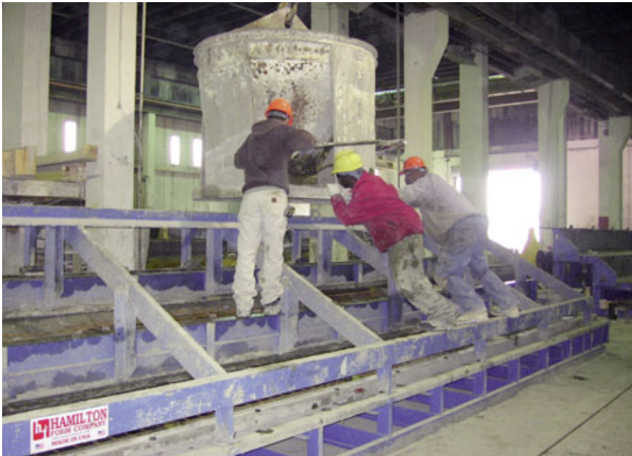
Colts stadia form at Coreslab Indianapolis

very few forms while others may require as many as eight, twelve or even more unique forms. Construction sequence must also be factored into the plan to ensure that delivery schedules are met.