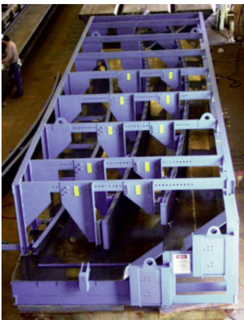
Adjustable curved stadia form

The number of forms needed for a stadium depends on the number of different cross sections and the quantity of each cross section required. Some stadiums call for relati-