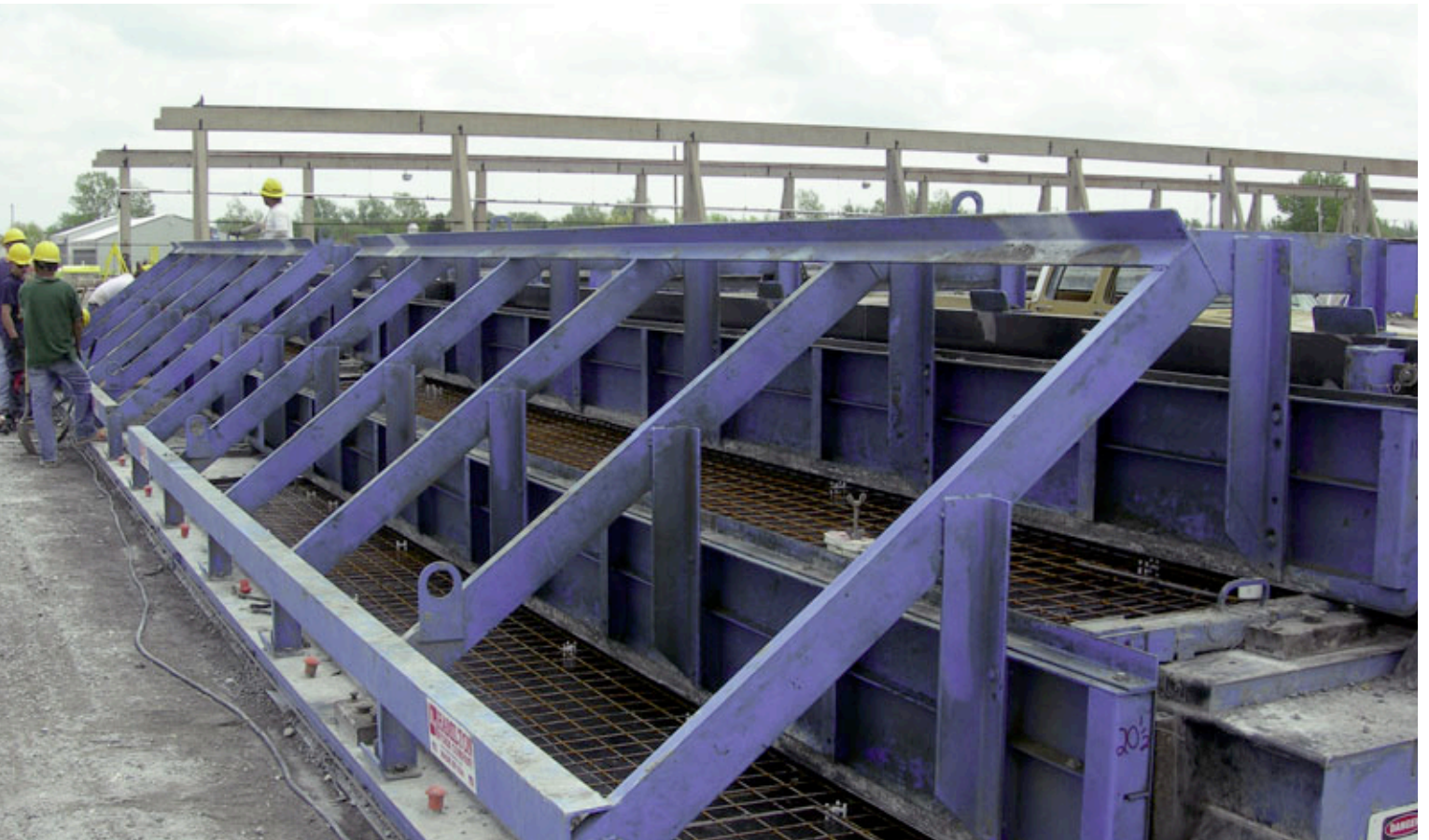
Double L Riser for Intrust Arena at Prestressed Concrete, Inc

Formwork for smaller stadiums is often very tricky. Smaller stadiums usually have the same – or even more different cross sections than some of the larger stadiums. Because the investment in forms has to be applied over fewer pieces, the forms need to work harder. Smaller stadiums often utilize forms with more adjustability so they can cast a number of different products. Adjustments increase set-up time at the plant and make the forms more complicated, but can pay for themselves by reducing the overall cost of the project.