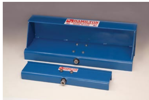
The 500 lb capacity magnet can be used on 2-inch rails. The 2,000 lb capacity magnet can be used in larger rails.

For more information about magnetic steel form and side rail systems, contact Hamilton Form Company at 817 590-2111 or e-mail us at sales@hamiltonform.com .