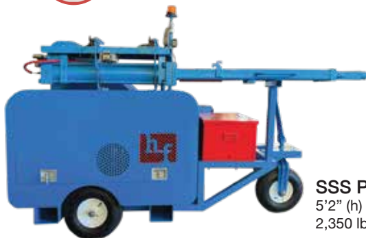
SSS Pro 5'2" (h) x 3'6" (w) x 7'9" (l) 2,350 lbs